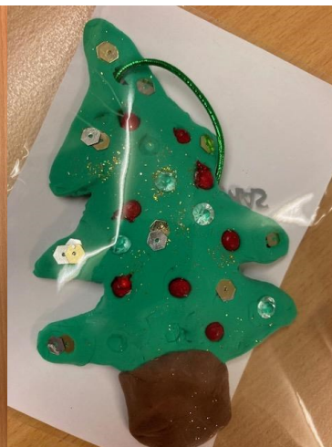
3rd place - Oriah (1W)