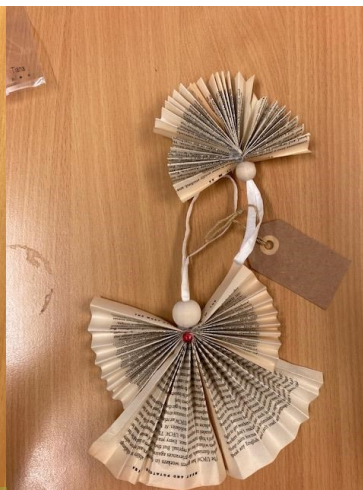
2nd place - Nina (4R)