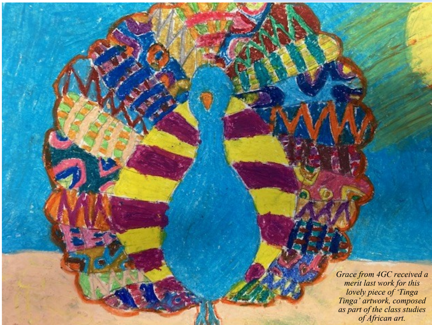
Grace from 4GC received a merit last work for this lovely piece of 'Tinga Tinga' artwork, composed as part of the class studies of African art.