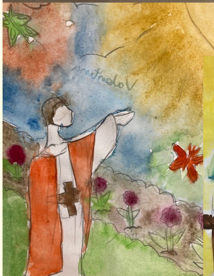
Some lovely Year 4 Easter RE and artwork