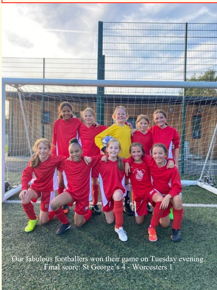
Our fabulous footballers won their game on Tuesday evening. Final score: St George's 4 - Worcesters 1