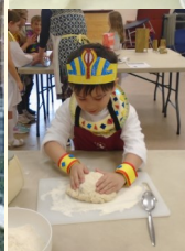
Year 3 really enjoyed their Egyptian Day on Wednesday...and they looked brilliant!