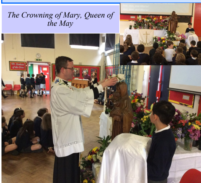
The Crowning of Mary, Queen of the May

Holiness by putting Love into Action every day.