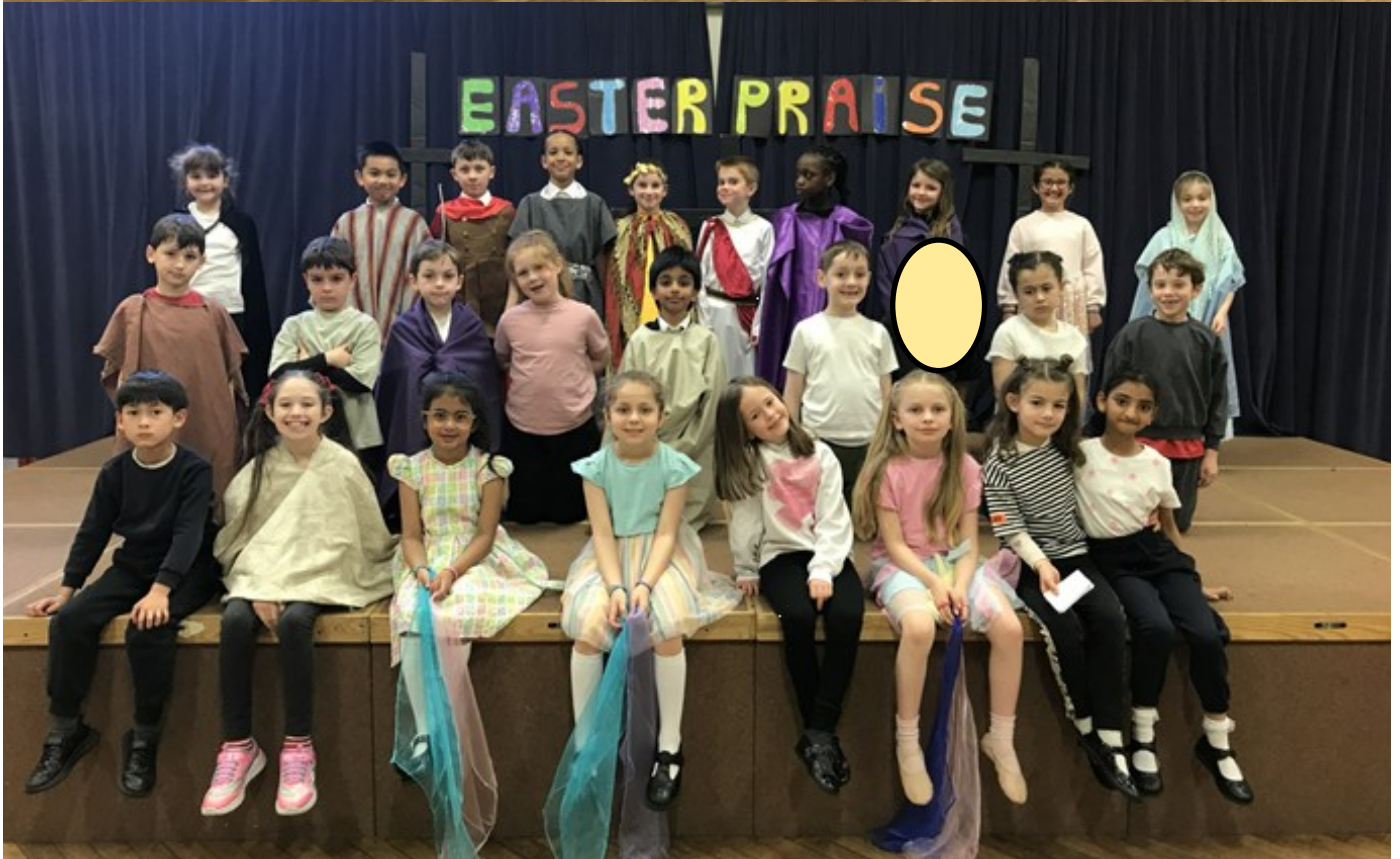
We are really proud of our year 3 pupils who staged a fantastic performance of Easter Praise this week. This joyous retelling of the Easter story helped us all to deepen our understanding that the resurrection of Jesus brings hope and new life. Just illustrates how young children can actually be brilliant teachers! A stunning performance.