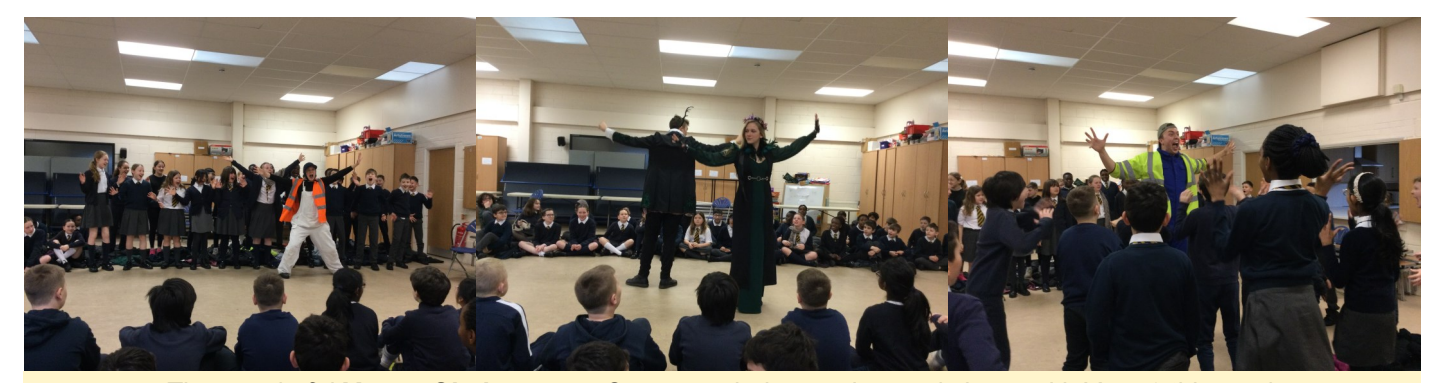
The wonderful Young Shakespeare Company led engaging workshops with Year 6 this week