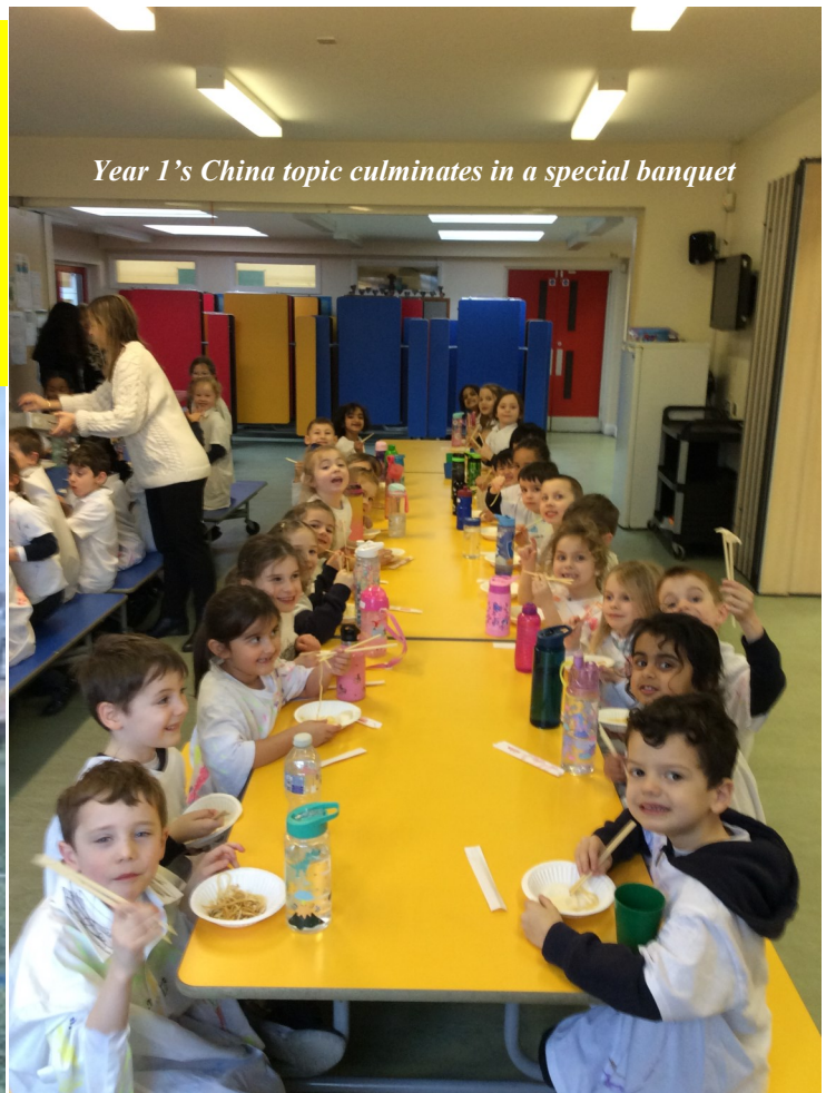
Year 1's China topic culminates in a special banquet