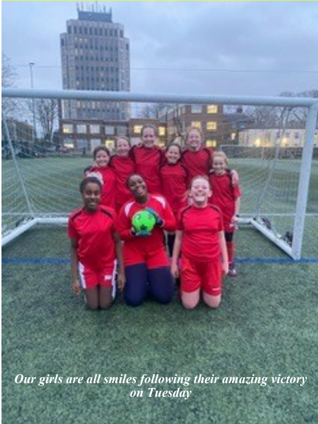
Our girls are all smiles following their amazing victory on Tuesday