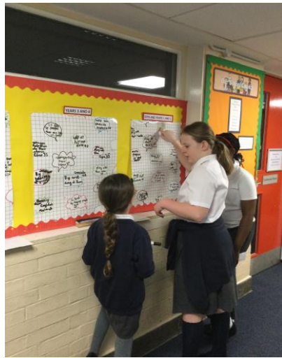
Some members of our Liturgy team helping some of the children in the infants to write their response to our weekly mission.