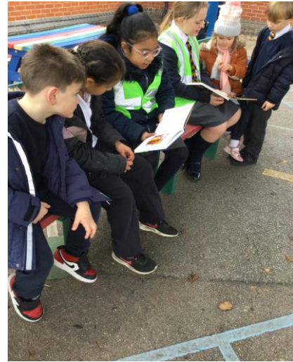
Some of our Liturgy Team reading the Nativity story to the children in the infant playground.